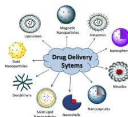
Drug Delivery System