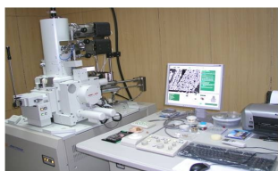
Field Emission Scanning Electron Microscope