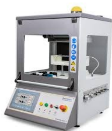
Electrospinning Unit for Nanofibers