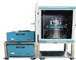
Photochemical Reactor for Degradation of Pollutants