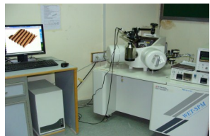
Atomic Force Microscope