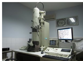
Transmission Electron Microscope