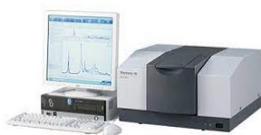
Fourier Transform Infrared (FTIR)