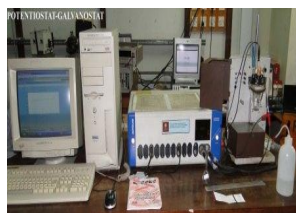
Potentiostat (Biosensing application studies setup)